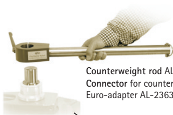
Counterweight rod AL-2361 Connector for counterweight rod on Euro-adapter AL-2363

The Combi-Rig is the more variable replacement for the low rig / snake arm.