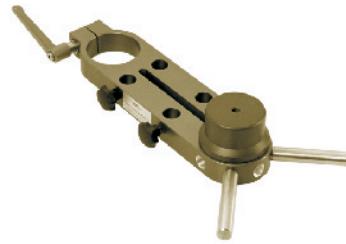
Off-Set Euro-adapter extension allows variable positioning of Euro-adapter, connection pin or foot support fitting AL-2370