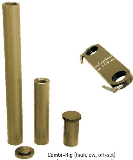
Combi-Rig (high,low, off-set) 3 tubes (15cm, 35cm, 73cm) 1 top section (41cm / 16") 2 safety crews AL-2360