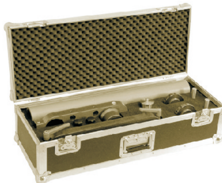
Transport case for Combi-Rig (without contents) AL-2368