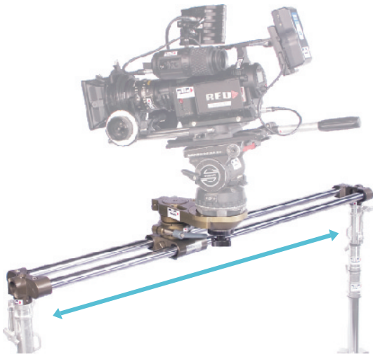
GF-Mini Bangi with 150cm / 5ft tubes, mounted on 2 lighting stands

In addition to the standard tubes, 150cm / 5' lengths are also available for longer tracking shots. The GF-Mini Bangi can be rigged in a wide manner of ways, for example between 2 lighting stands. Its light weight construction makes it ideal for use on car rigs and jib arms where it can be used to compensate for the arc of the jib arm. Other rigging adapters are also available for connecting to scaffold tubes.