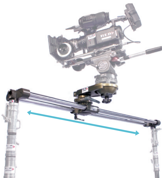
150cm / 5ft tubes, mounted on 2 lighting stands