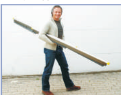
Foldable and lightweight